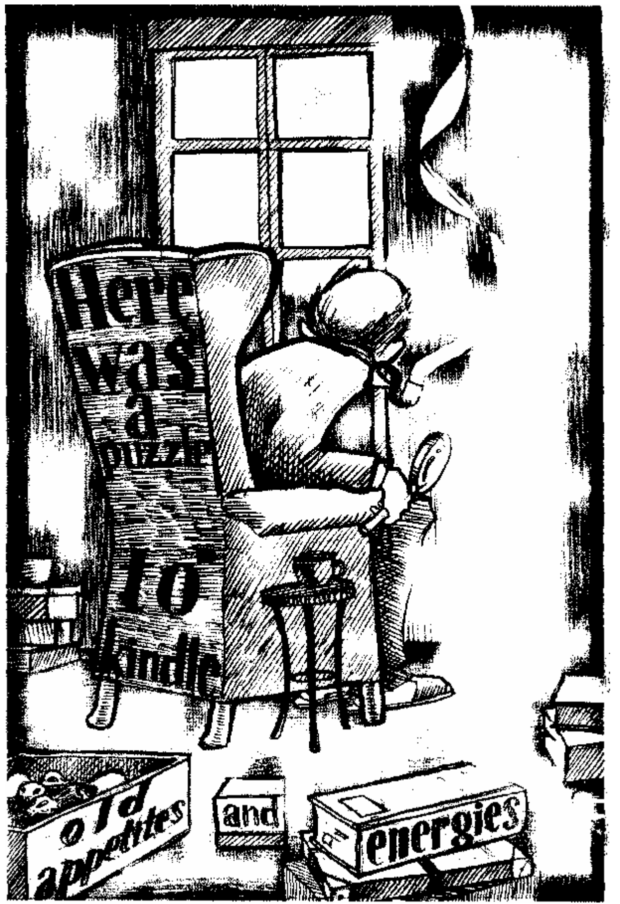
There were so many queer aspects to Sunday dinner at the Panicker table that Mr. Shane, the new arrival, aroused the suspicions of his fellow lodger Mr. Parkins merely by seeming to take no notice of any of them. He strode into the dining room, a grand,